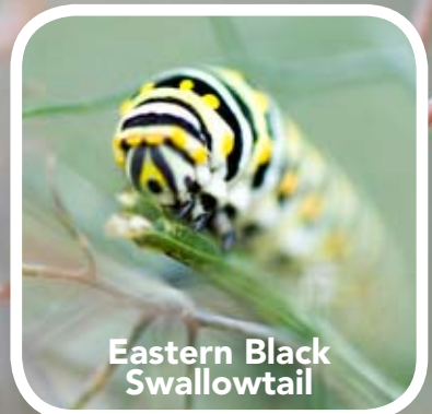
Eastern Black Swallowtail

Milkweed ( Asclepias spp.) Look for pink swamp milkweed, 'Ice Ballet', blood flower, or orange butterfly weed.