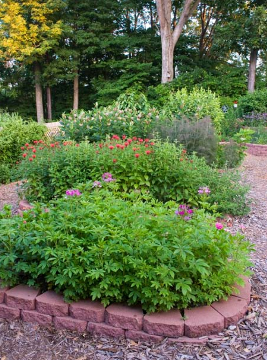
LEFT: Wayne gardens in raised beds which provide good drainage. Mulched paths and edging made with concrete pavers maintain a tidy appearance around plantings of cleome, bee balm, fennel, and milkweed. BELOW: Christine holds Zebra Swallowtail eggs and baby caterpillars. It will take another seven to 10 days for the caterpillars to grow to full size. BOTTOM: A Zebra Swallowtail feeds on milkweed, but it commonly lays eggs on the Pawpaw tree.