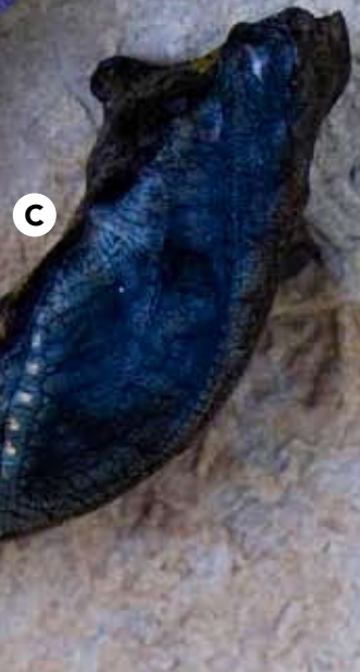
A colorful medley of swallowtail butterfly cocoons: A. Zebra, B. Spicebush, C. Pipevine, and D. Eastern Black.