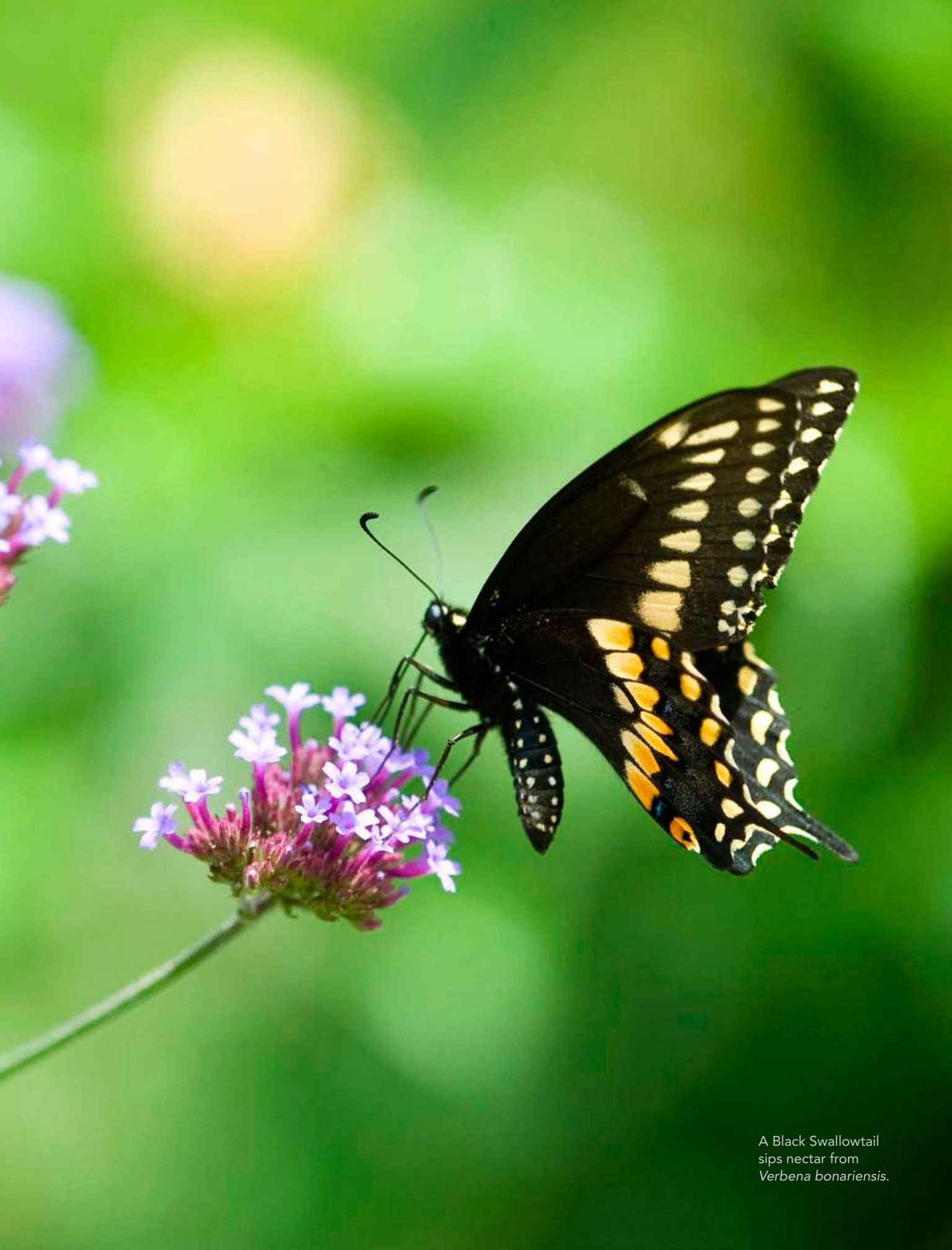
A Black Swallowtail sips nectar from Verbena bonariensis .